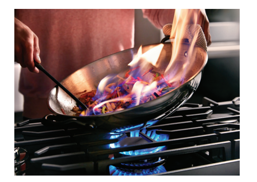
The burner you choose should depend on both the cooking technique and the cookware you are using. Use the smaller burners for simmering and braising, the all-purpose burners for sautéing or frying, and the large burners for searing and boiling.