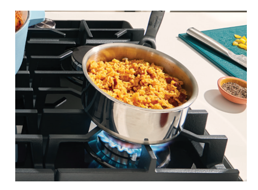
5K BTU BURNER

A glass top surface that easily wipes to a reflective shine with just soap, water, and a soft cloth.