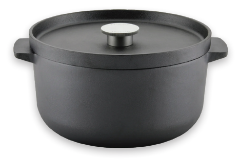
Kitchenaid® Seasoned 6-Quart Cast Iron Dutch Oven (Pre-Seasoned Cast Iron)