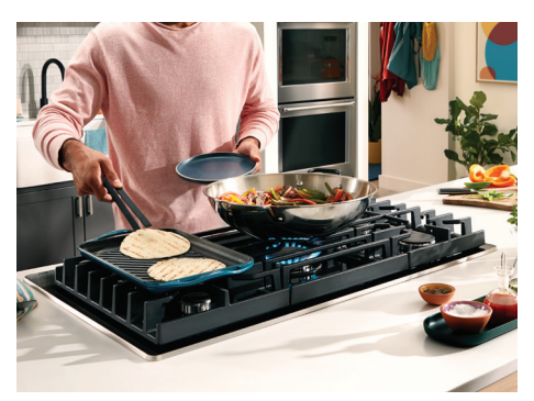
TWO 9.1K BTU BURNER Use your 9.1K BTU Burner for your daily cooking, searing and sautéing.

A flame sized for small saucepans to manage low temperatures for simmering sauces until they look, feel and taste delicious.