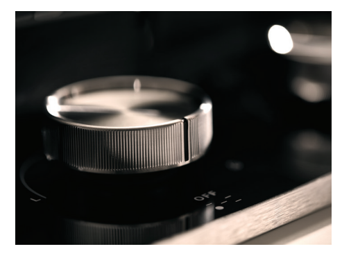
DISHWASHER-SAFE METAL KNOBS

Professionally-inspired dishwashersafe knobs are easy to clean and allow easy adjustment of cooktop settings, offering responsive, flexible control.